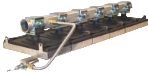
Rear view – Type 50 assembly