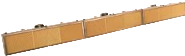
Front view – Type 13 assembly

RadMax™ Burners can economically increase production rates, reduce seconds and defects caused by improper or uneven heating or drying, and reduce down time and maintenance costs when the need for service or repair arises.