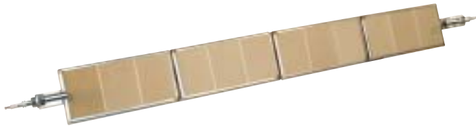
Front view – Type 25 (end-to-end) assembly