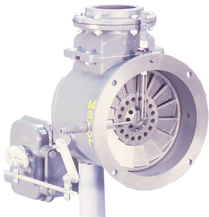
Series "67" LB TUBE-O-FLAME® Burner showing version less blower for those applications requiring multiple burner zones from common combustion air source